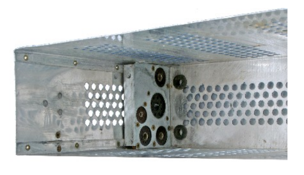
Internal view of the metal enclosure showing a tray for fitting spare valves and vibrator.

© This WftW Volume 4 Supplement is a download from www.wftw.nl. It may be freely copied and distributed, but only in the current form.